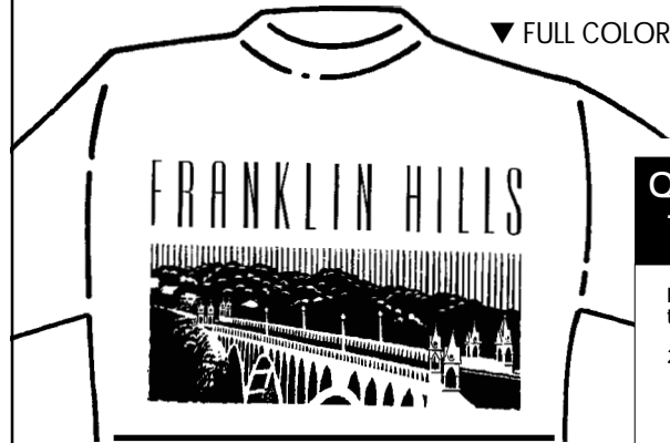
▼ FULL COLOR