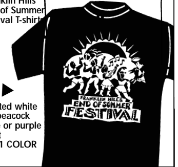
Printed white on peacock blue or purple shirt 1 COLOR

Now get the classic Franklin Hills/Shakespeare Bridge design in full color, printed in crisp detail on a 100% cotton shirt. Also, limited quantities of the original T's are available while they last. Shirts are designed and illustrated by Eugene Cheltenham of Franklin Hills. All profits go to fund Franklin Hills Residents Association projects to enhance the Franklin Hills area.